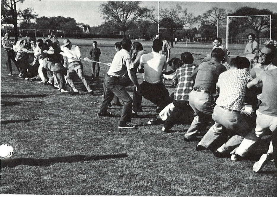
Dallas Autumn Picnic Tug-O-War. P U U L L L !

With most FAVORABLE weather on the first day of November some 230 adults and children were on hand for what is getting to be an annual event in Dallas—an autumn picnic. All the ingredients necessary for a successful picnic were available. Ample space and marked grounds for baseball and volleyball games were put to use. And food—yes—the abundance and variety