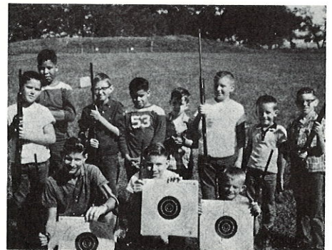
Marksmen score high on rifle range

The group “armed” with sack lunches and drinks enjoyed an on-the-spot chow-time after comparing targets and scores.